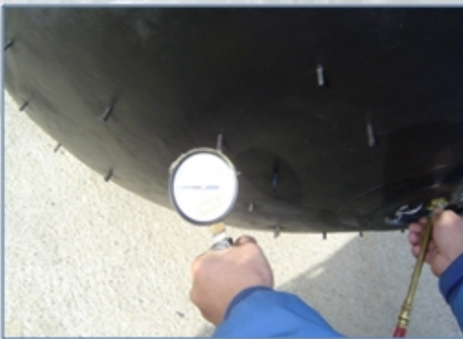
AIR LEAKAGE TEST