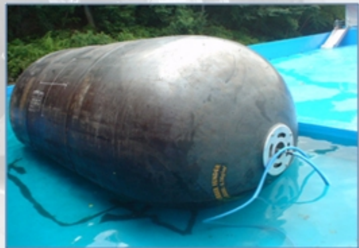
HYDROSTATIC PRESSURE TEST